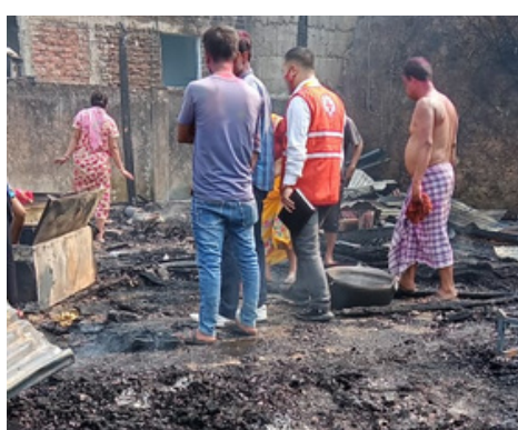
Red Cross team visited the fire accident site, Itanagar, Arunachal Pradesh