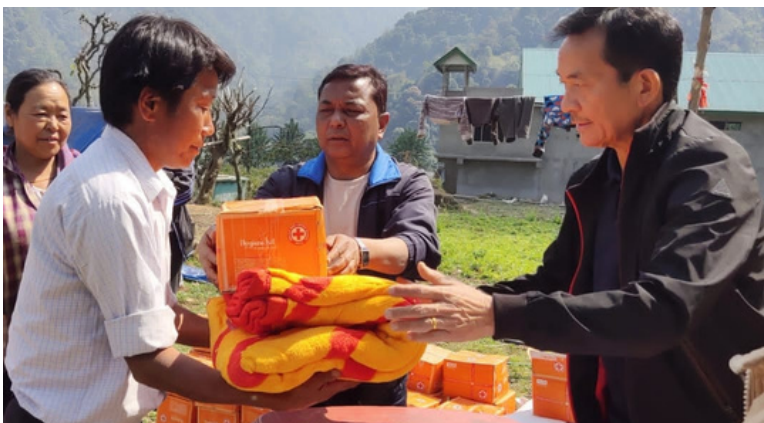
Distribution of blankets & hygiene kits, Pakyong district, Sikkim