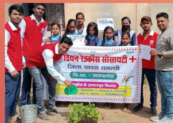
World Water Day, Dhamtari, Chhattisgarh