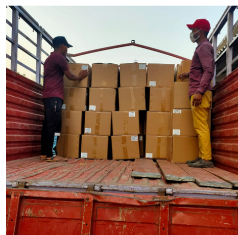
Oximeters being despatched from OSB warehouse in Bhubaneswar to Bhopal, Raipur and Kolkata