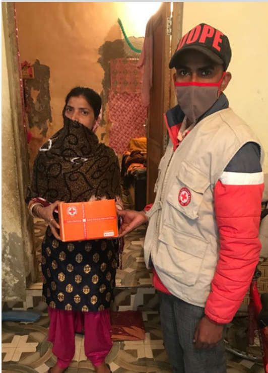
Distribution of hygiene kits to TB patients, Jalandhar, Punjab