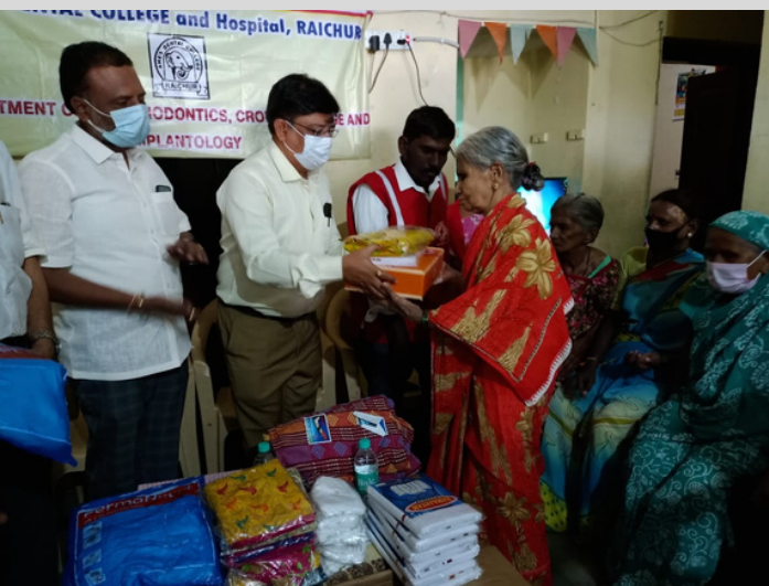
Bedsheets, toothpaste, soaps, mosquito nets and other daily use items were distributed to old and needy people, Raichur, Karnataka.