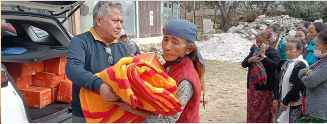
Distribution of blankets & hygiene kits, Namphing, Sikkim