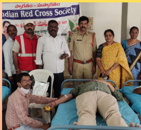
Voluntary Blood donation camp, at Pebbair, Wanaparthy district, Telangana