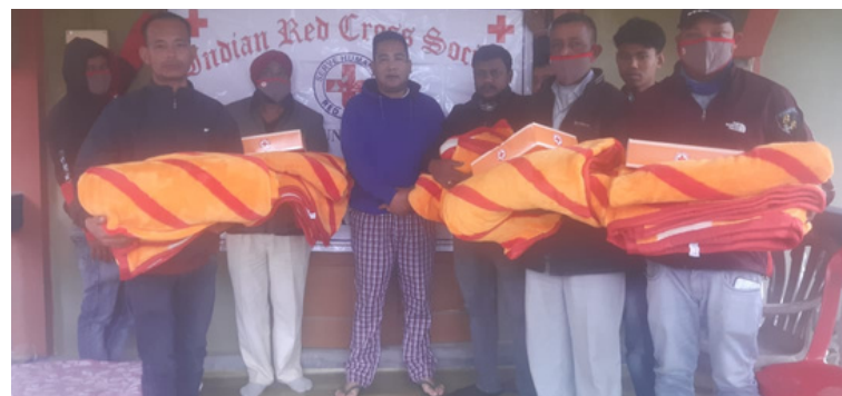
Distribution of hygiene kits & blankets, Arunachal Pradesh