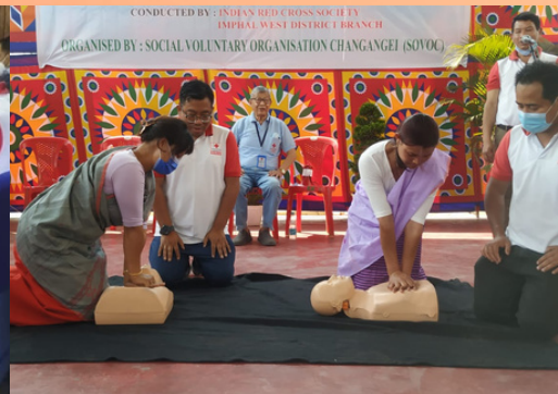
Two days awareness program on First Aid was conducted by IRCS, Imphal West district branch during Holi break.