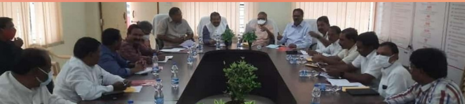
IRCS, Telangana State Managing Committee Meeting