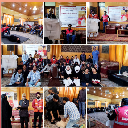
3-Days first aid training programme organized by IRCS, J&K branch