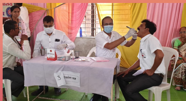
Health Camp Ravi, Maharashtra