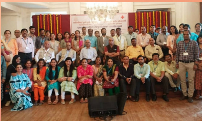
Savitribai Phule Pune University, Vidhyarthi Vikas Mandal and IRCS, Youth Red Cross, Pune organized one day Counsellors Training Program. 43 Counsellors from 30 different colleges attended this program.