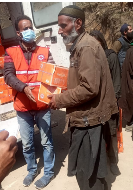
Distribution of hygiene kits, Jammu