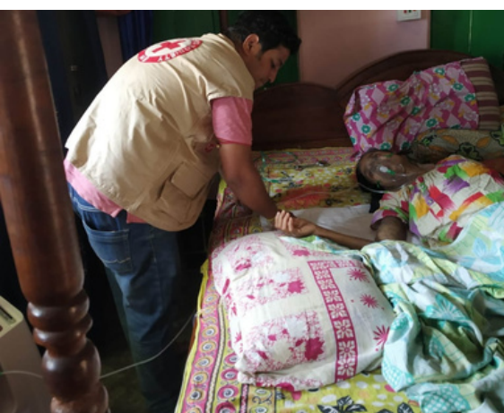
Birbhum, IRCS branch, West Bengal provided Oxygen concentrators to the patients