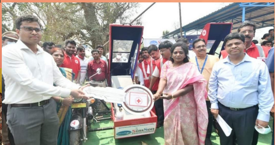
Hon'ble Governor & President, IRCS, Telangana state branch Dr. Tamilisai Soundararajan handed over the two-wheeler (bike) ambulances for the benefit of remote tribal habitations situated in inaccessible deep forest areas of Appapur & Bourapur villages in Nagar Kurnool.