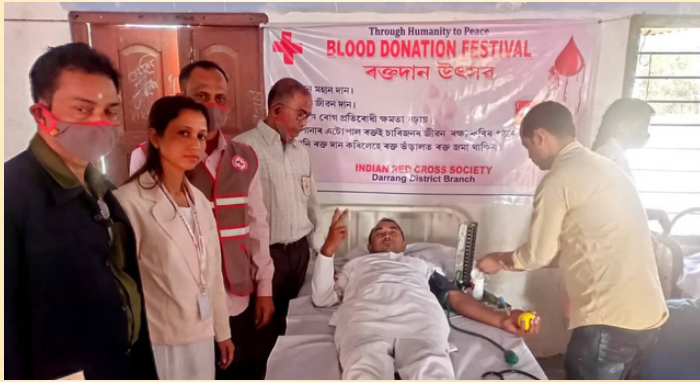
Blood donation camp, Darrang, Assam