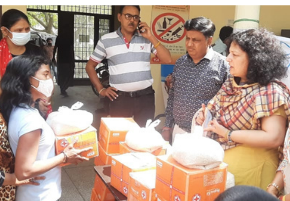
Dry ration was distributed amongst needy female inmates at an old age home, Ambala, Punjab.