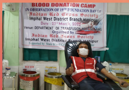
Awareness cum blood donation camp was observed on the 19th Foundation Day of IRCS, Imphal, West district branch. Altogether 13 units of blood were collected.