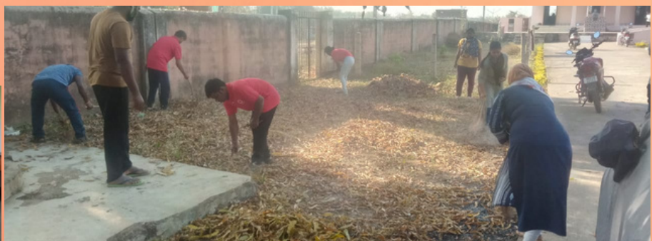
Cleanliness drive at Nayagarh, Odisha