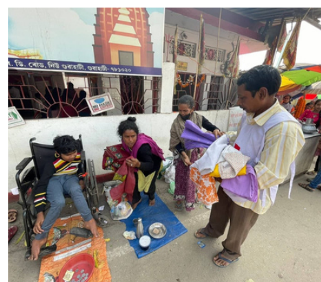
Distribution of Clothes, IRCS Guwahati, Assam

We are grateful to all our Donors and Volunteers for their generous support for IRCS relief efforts on behalf of millions of underprivileged and vulnerable families struggling to survive in the aftermath of the COVID-19 Pandemic. Thank you for your compassion, patience and contribution.