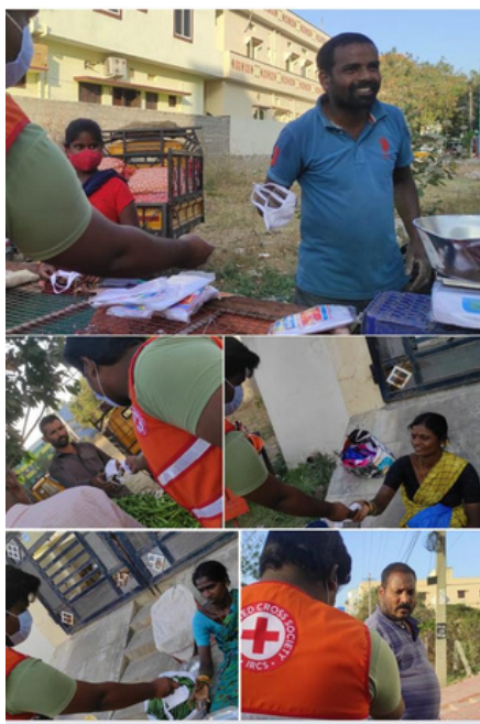
Distribution of masks, Malkajigiri, Telangana