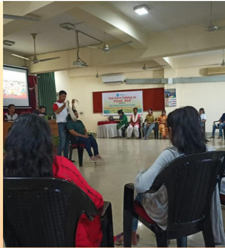
Guwahati First aid training