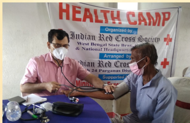
Indian Red Cross Society, North 24 Parganas district branch, West Bengal organised a Health Camp at Village Sulkuni