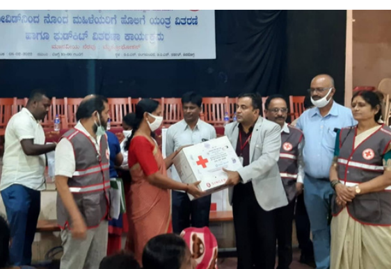
Livelihood Support Program Jeevan Dhara for Covid Affected families, Karnataka