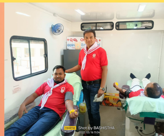
Blood donation camp, Koraput, Odisha.