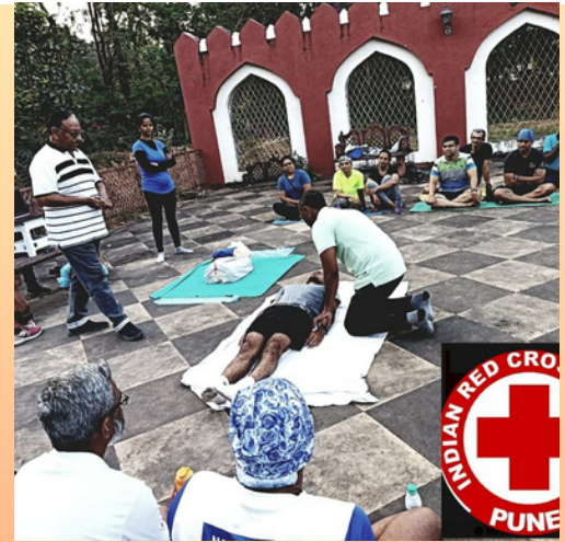
First Aid & CPR awareness program for was held for runners, Pune, Maharashtra.