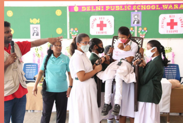
First aid training, IRCS, Telangana.