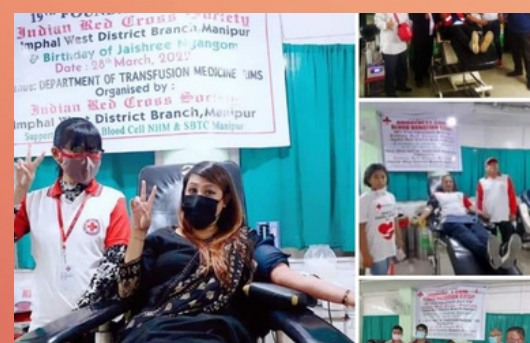
Blood donation, Imphal West, Manipur