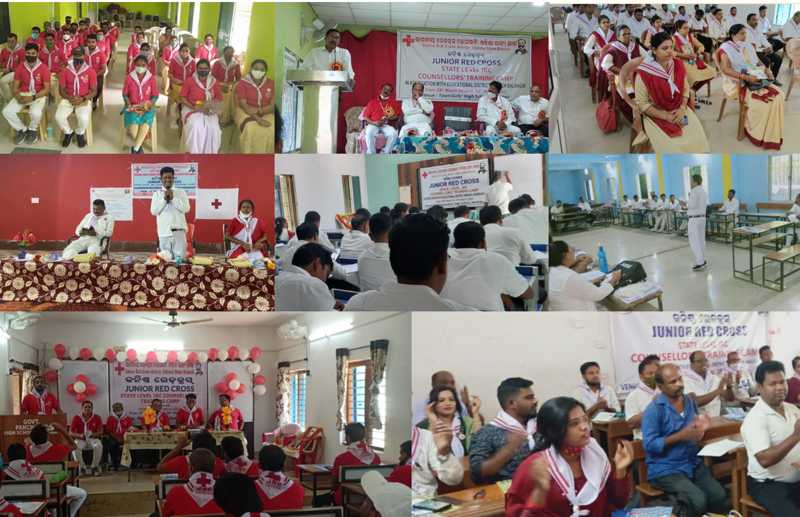
JRC, Counsellors Training Programme was held at various districts (Nabarangpur, Rayagada, Boudh, Sundargarh, Kendrapara, Sonepur) of Odisha.