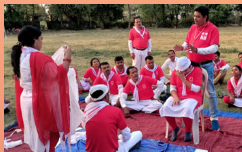
First aid training to counsellors during counsellor training camp at Sonepur district, Odisha