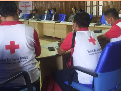
Volunteers of IRCS, Imphal, West district branch took part in a 2-Day workshop on voluntary blood donation