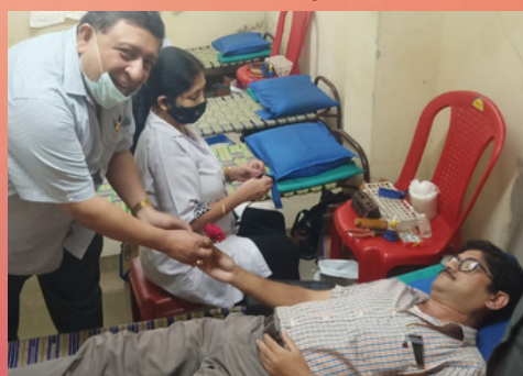
Blood Donation Camp organised by IRCS Staff Union- West Bengal