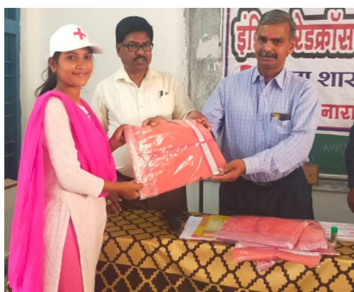
Distribution of Jacket, Bagbahara, Chhattisgarh