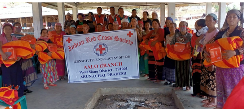
Distribution of hygiene kits & blankets, West Siang, Arunachal Pradesh.