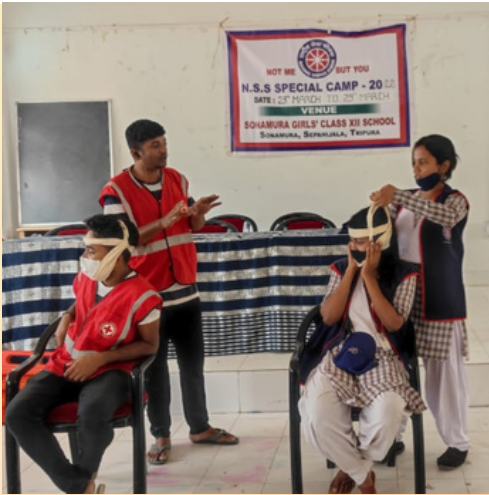
N.S.S Special Camp 2022, Sonamura, Tripura