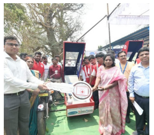
Hon'ble Governor & President, IRCS, Telangana state branch Dr. Tamilsai Soundararajan handed over the two-wheeler (bike) ambulances for the benefit of remote tribal habitations in inaccessible deep forest areas of Appapur & Bourapur villages in Nagar Kurnool.

We are grateful to all our Donors and Volunteers for their generous support for IRCS relief efforts on behalf of millions of underprivileged and vulnerable families struggling to survive in the aftermath of the COVID-19 Pandemic. Thank you for your compassion, patience and contribution.