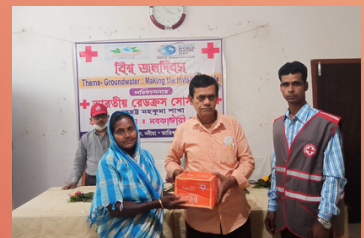
Distribution of Hygiene kits on World Water Day, Tehatta, West Bengal