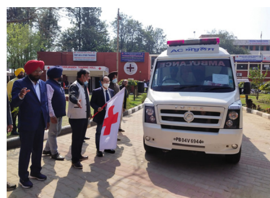
Punjab Red Cross provided Covid related materials to its district branches