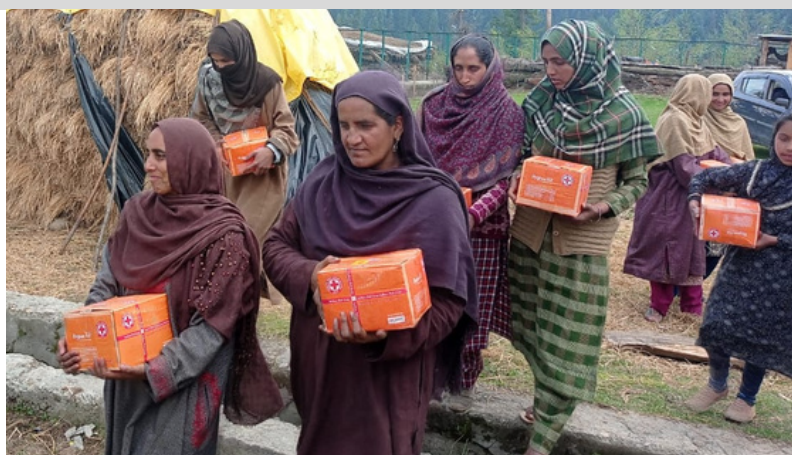
Distribution of hygiene kits, Jammu