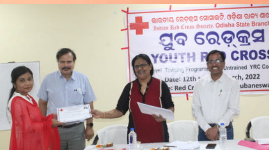
State level training programme for untrained YRC Counsellors, Bhubaneswar, Odisha