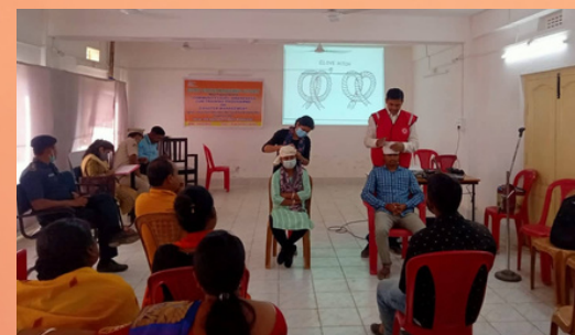
Community level awareness cum training on DM by Bamutia West Tripura