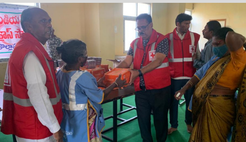
Hygiene kits distribution to sanitary workers of Kollapur municipality, Telangana