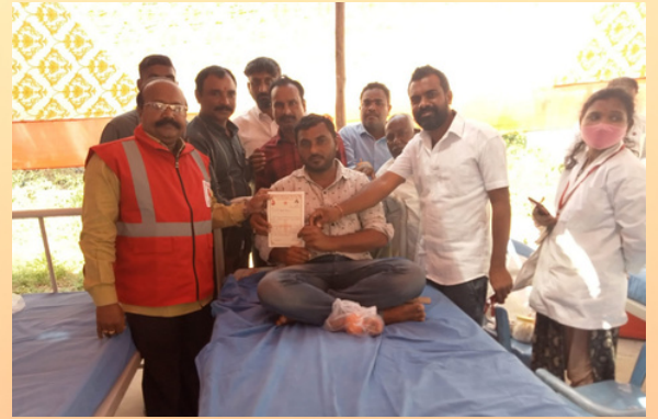
Blood donor felicitated at blood donation camp, Manchiryal, Telangana