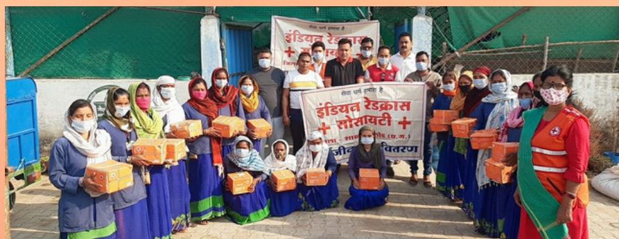
Cleanliness drive, Dondi, Chhattisgarh