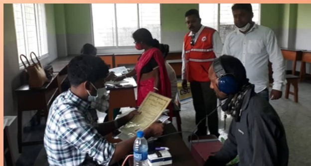
Screening Camp was held at Jalpaiguri, West Bengal for the distribution of aids and appliances to PWDs & Senior Citizens conducted by ALIMCO and District administration, Jalpaiguri in support of IRCS, Jalpaiguri district branch.