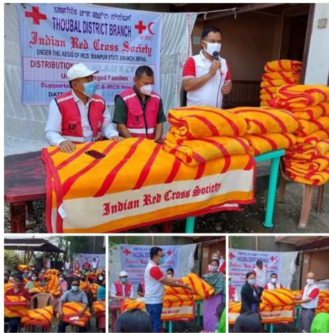
Distribution of blankets, Thoubal, Manipur