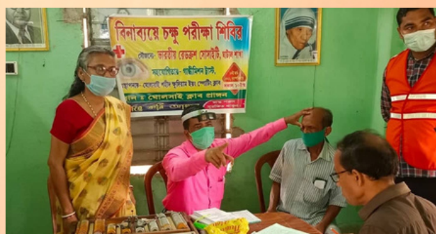
Free Eye check-up camp was organized by Ghatal sub-division branch of IRCS & Gandhi Mission Trust at Gholsai Shaheed Khudiram Young Sporting Club Building, Ghatal, West Bengal.