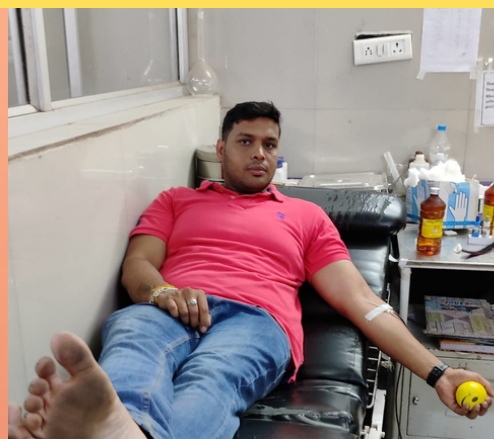
Blood donation, Raigarh, Chhattisgarh