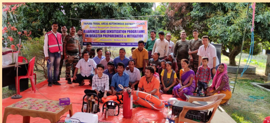
Awareness cum sensitization programme was held on disaster preparedness and mitigation at Belbari Farm, TTAADC Jirania, West Tripura