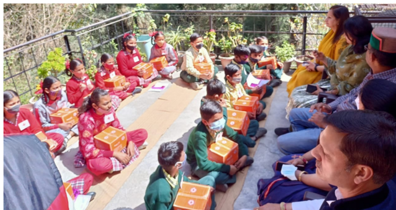
Distribution of hygiene kits to school children at Shimla, Himachal Pradesh