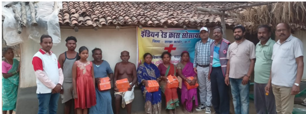
Distribution of hygiene kits, Kanker, Chhattisgarh