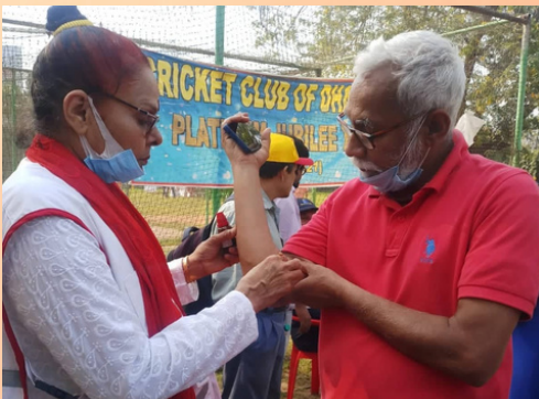
First Aid cum Medical camp was organised by IRCS, South 24 Parganas district branch, West Bengal during the Kolkata Marathon Race at Rabindra Sarovar Lake.