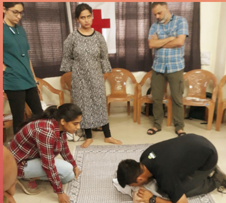
First aid training, IRCS, Pune.