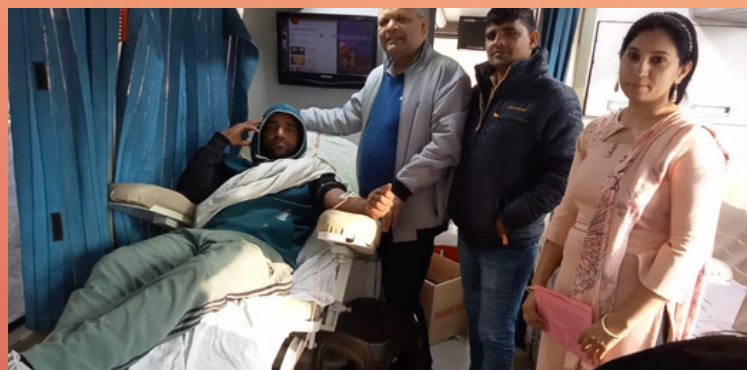
Blood Donation Camp, Haryana