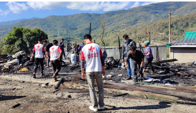
Volunteers of Senapati district of Manipur took the situational analysis & distributed some relief materials amongst the fire victims