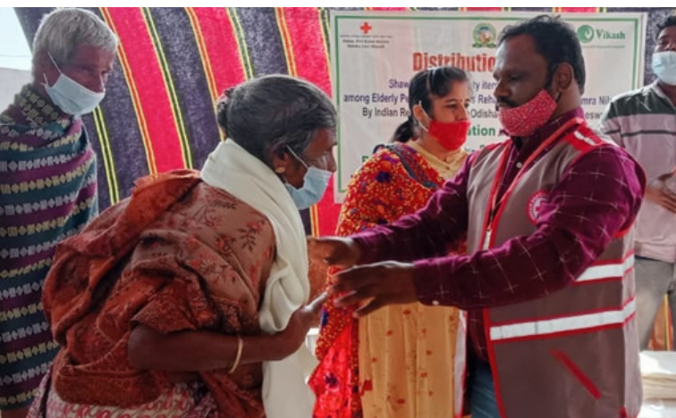
IRCS Odisha state branch distributed shawls to the poor and needy