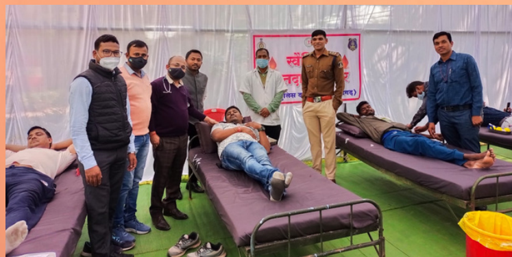
Blood Donation Camp, Dantewada, Chhattisgarh