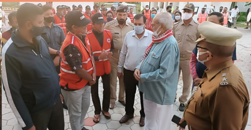
On the eve of International volunteer day a discussion was held between Hon'ble Governor of Odisha & volunteers on the capacity building of the volunteers for managing different disasters & volunteerism during the time of bare need.