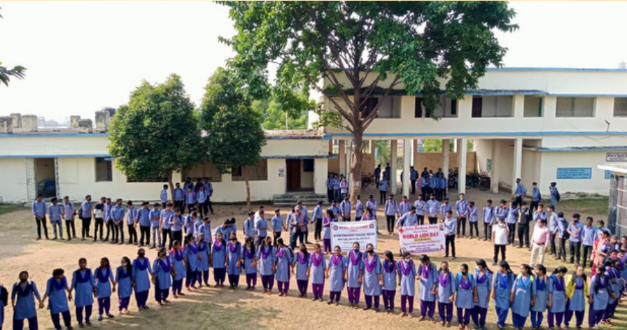
World AIDS Day was celebrated at Boudh Panchayat college, Boudh by YRC, Odisha state branch in collaboration with NSS & NCC. A large human chain of red ribbon was formed on the occasion to create awareness amongst mass.