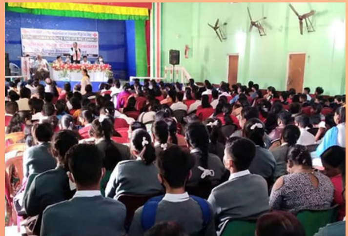
As part of observance of Human Rights Day, IRCS Margherita Sub district branch, Assam organised a seminar on Human Rights and its relevance at India Club, Margherita on December 10, 2021.