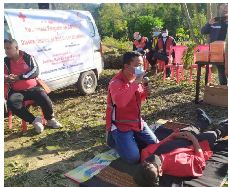
Awareness program on Covid-19 at Irong village organised by IRCS Manipur state branch