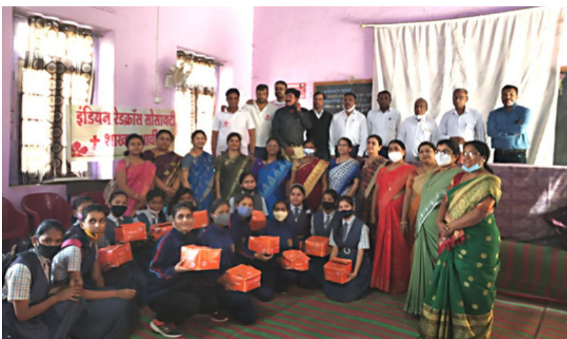
Distribution of hygiene kit, Arvi, Maharashtra