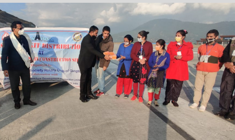
Sanitary kits & toilet soaps were distributed amongst the labour force by IRCS Sikkim at Pakyong airport.