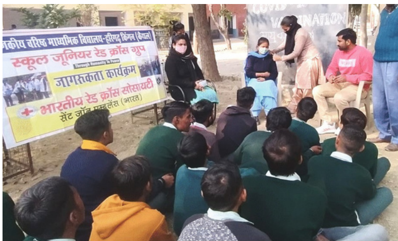
District Red Cross Society Kaithal and Education Department Haryana gave priority to Covid-19 vaccination. Vaccination was given to children in the government schools.