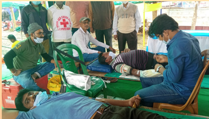
IRCS, Tehatta Sub district branch, West Bengal organised Blood Donation Camp at Saheb Nagar