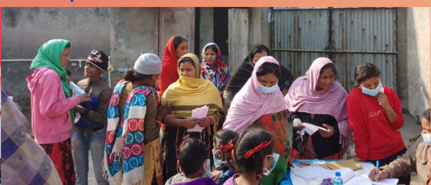
Health check-up camp was organised by GVM College, Sonipat,Haryana.About 250 students were examined and treated.