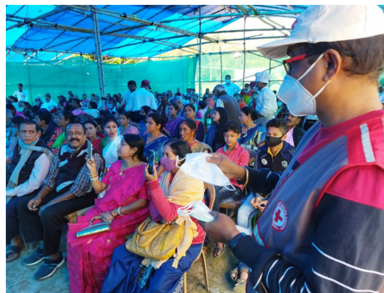
IRCS, Kandi SD-Branch, Murshidabad district, West Bengal attended Armed Forces Flag Day at Charak Taler Math at Kandi & aware mass on the importance of wearing masks