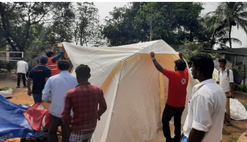
As part of Flood Response 2021, approx 50 family tents were pitched for tribal communities in Chengalpattu district of Tamil Nadu.