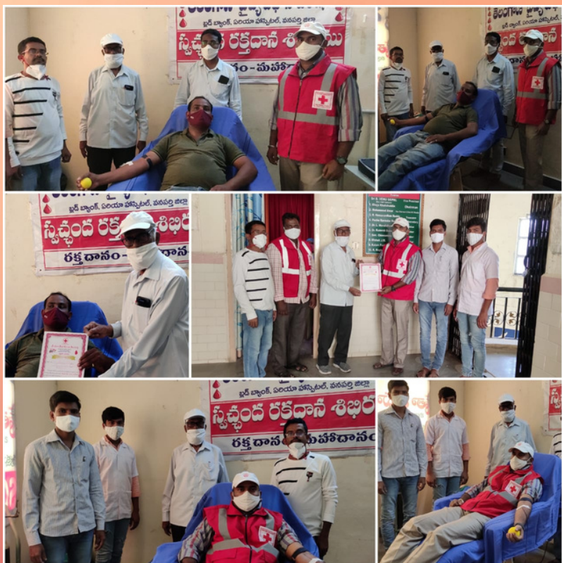
Voluntary Blood Donation Camp at Wanaparthi, Telangana