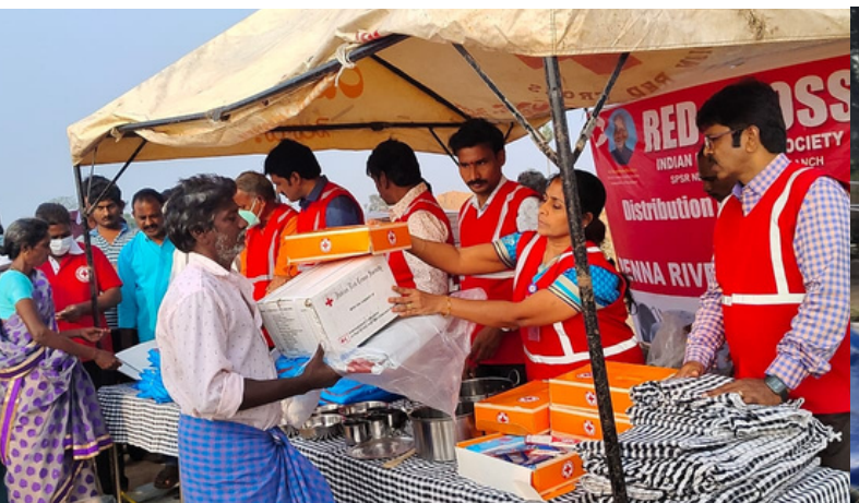
Distribution of relief materials to the flood victims in Nellore District, Andhra Pradesh