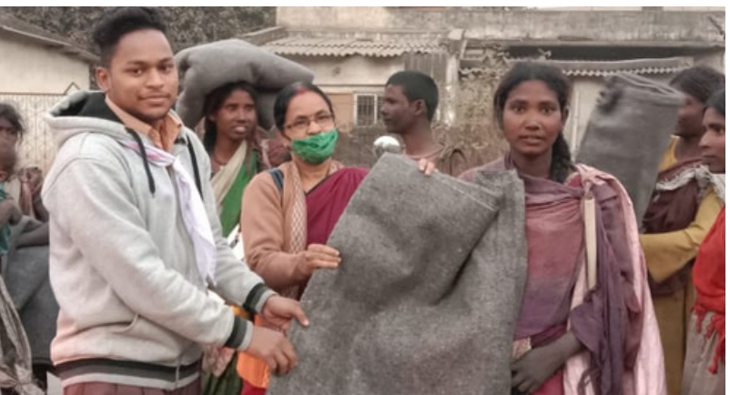
Distribution of blankets at Sundargarh with the help of YRC volunteers to the needy and homeless people, Odisha