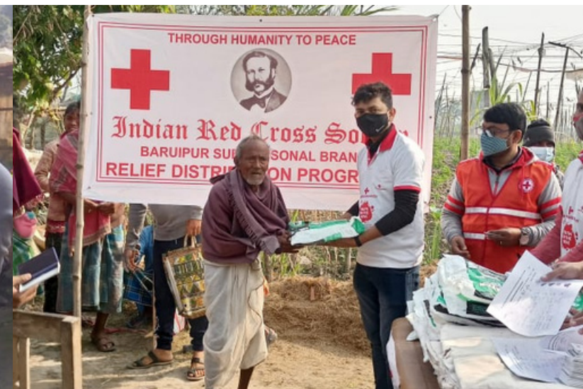
IRCS, Baruiapur SD branch distributed mosquito nets, Maggie noodles, mung, garments, masks to the needy people at Mousuni Island in Sundarban area, West Bengal