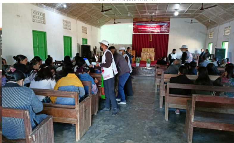
Distribution of mask, Nagaland