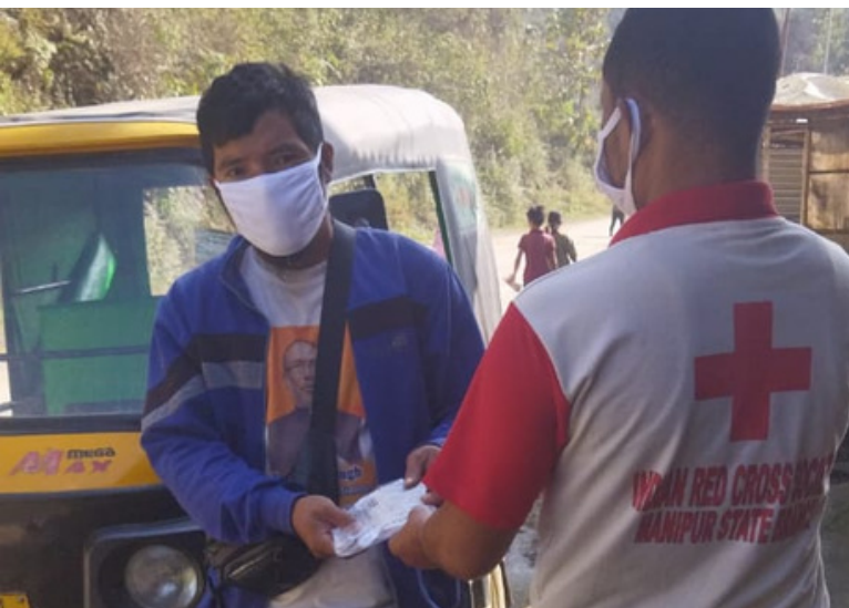
Mask distribution to auto drivers at far flung hill areas of Manipur by IRCS Imphal East district branch