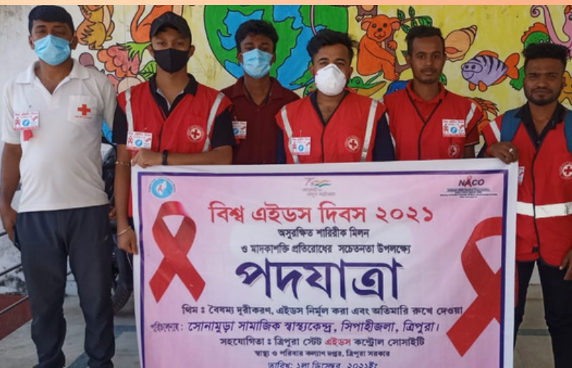
Observation of World AIDS day 2021, IRCS Sonamura Sub-divisional branch, Tripura