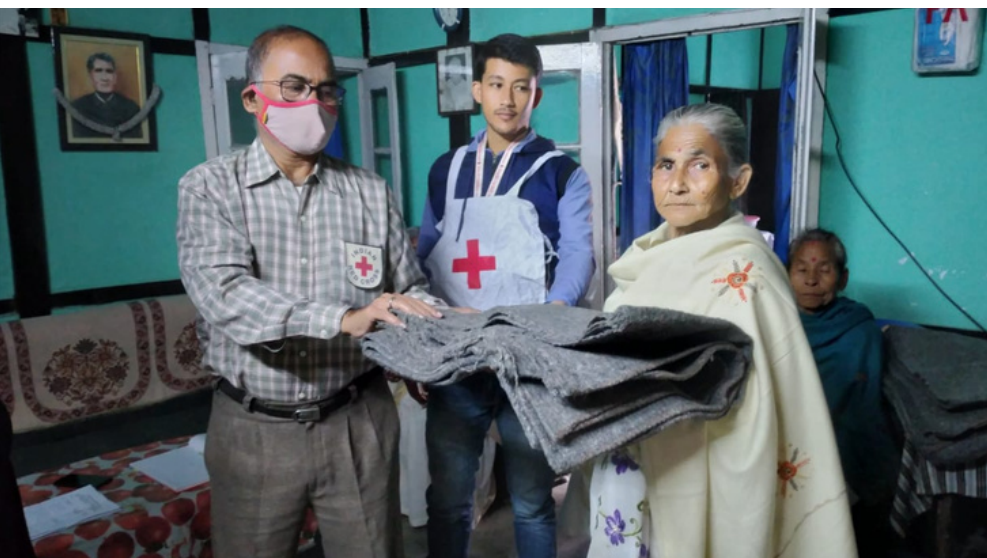
Blankets & soaps were distributed amongst elderly people at Kartik Chandra Barua Memorial Old Age Home by IRCS Darrang district branch, Assam