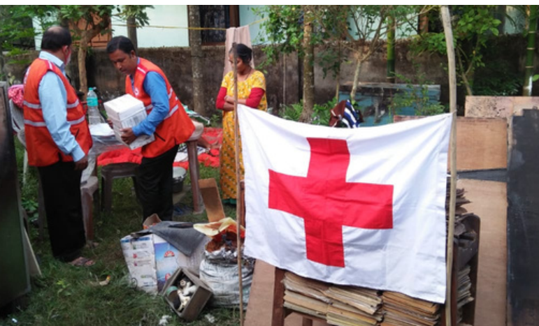
IRCS, Dakshin Dinajpur district branch, West Bengal helped fire victims at Balurghat Chakvrigu & Biswaspara area