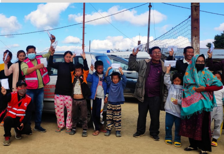
Distribution of masks at Irong village, Kamjongdistrict, Manipur