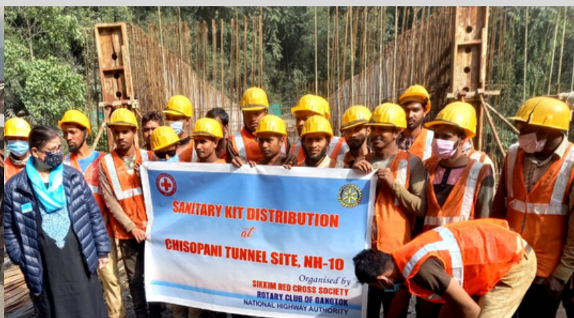
Sanitary kit distribution was held at Chisopani tunnel site, NH-10 organised by Sikkim Red Cross Society, Rotary club of Gangtok, National highway authority.