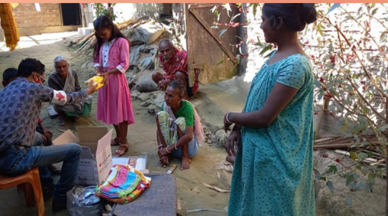
On the occasion of the International Volunteer Day, volunteers of IRCS Darrang district branch, Assam distributed various relief items amongst poor & needy.