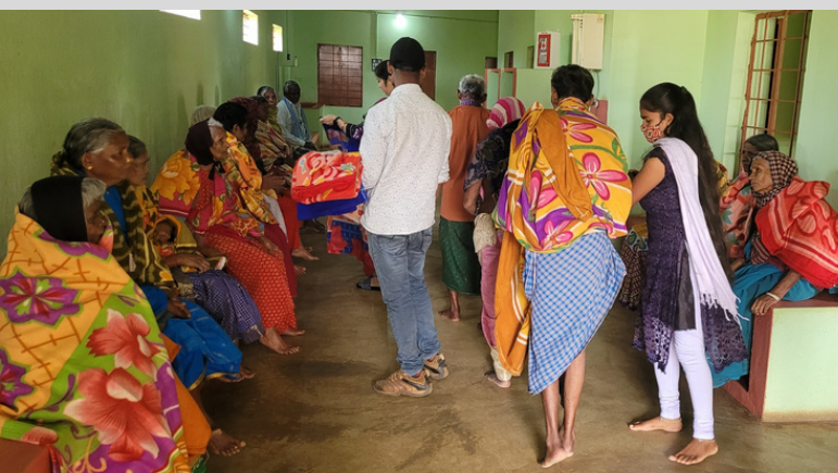
Distribution of blankets at an old age home in Koraput, Odisha