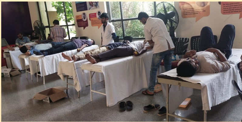
Blood Donation Camp, Telangana