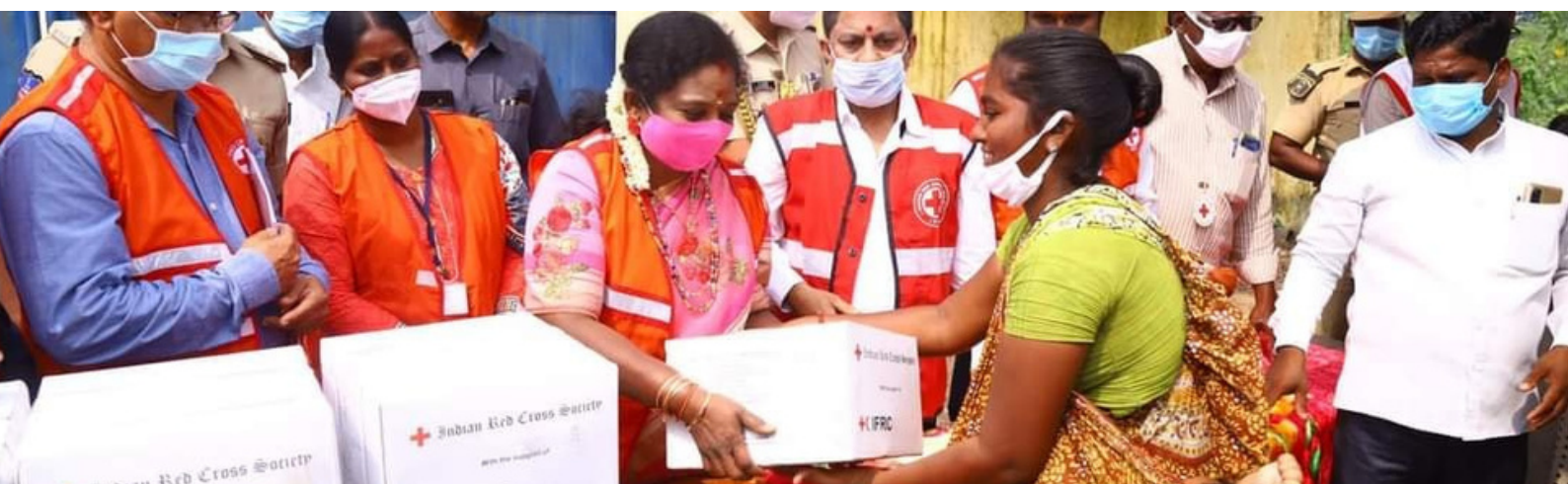
Flood relief materials were distributed amongst beneficiaries at Narikkuravar Settlement at Odiyampet, near Kombakkam, Puducherry by Dr. Tamilsai Soundararajan, Hon'ble Governor & President, IRCS, Telangana & Puducherry state branches.