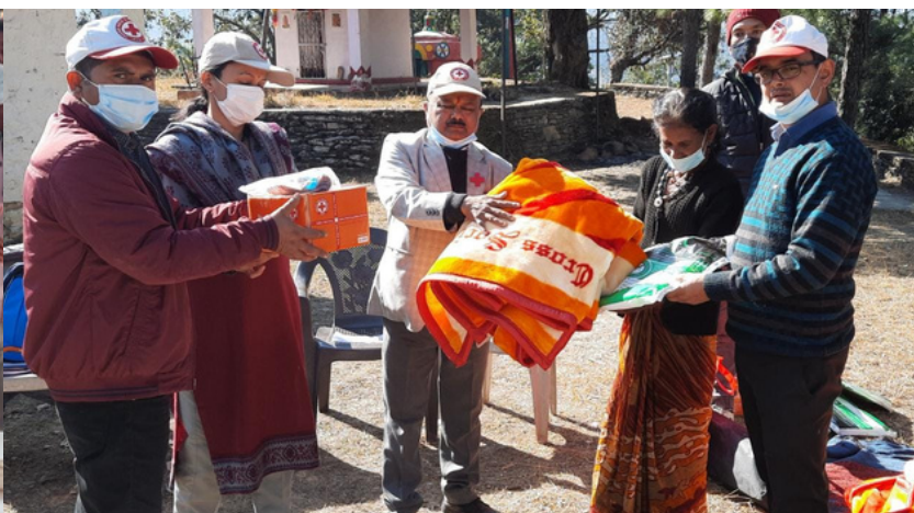
Distribution of blankets, Uttarakhand

We are grateful to all our Donors and Volunteers for their generous support for IRCS relief efforts on behalf of millions of underprivileged and vulnerable families struggling to survive in the aftermath of the COVID-19 Pandemic. Thank you for your compassion, patience, and contribution.