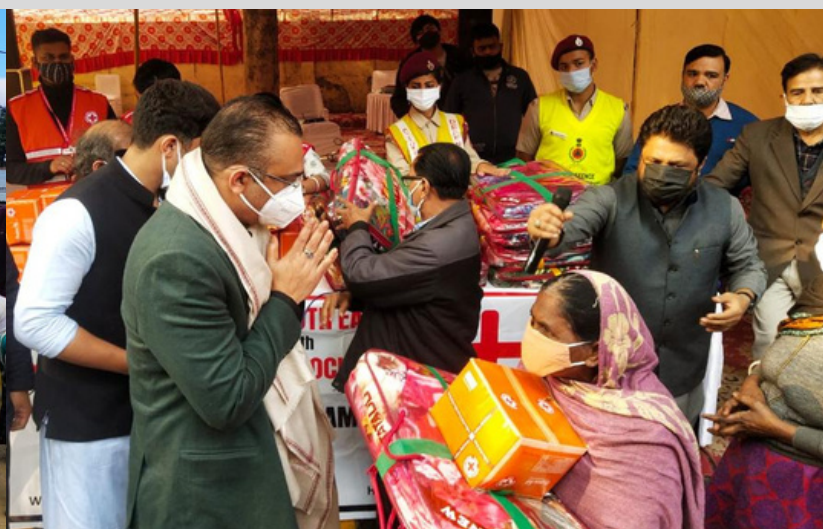
Distribution of blankets, heaters and sanitation kits by IRCS Delhi state branch