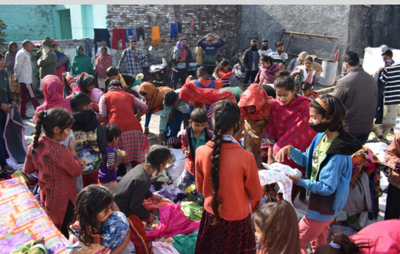
Woolen clothes being distributed amongst vulnerable near the border areas of pragwal, Jammu