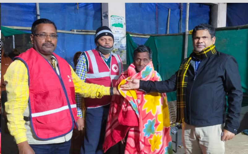
Distribution of blankets, Odisha