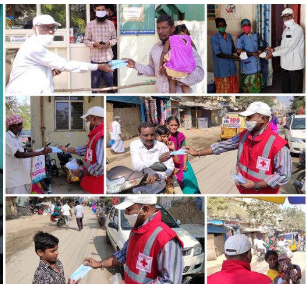
Distribution of mask,Telangana