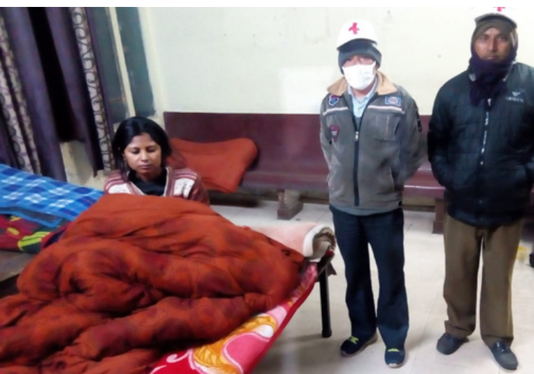
Volunteers of IRCS, Rewari, Haryana visited various places of the city & gave night shelters to the homeless & needy