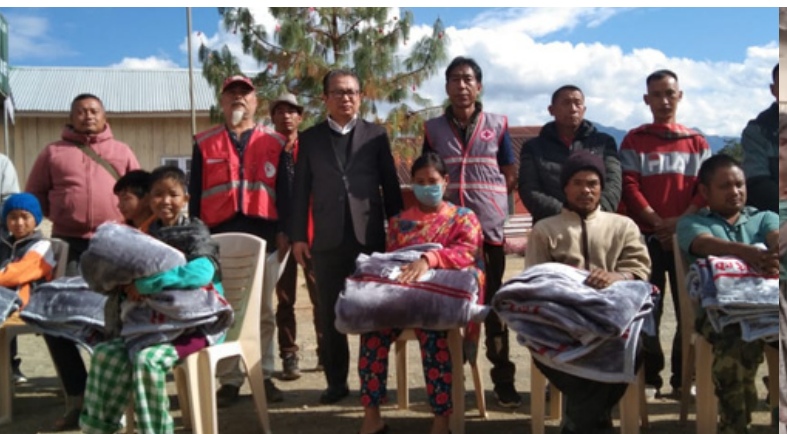
As part of Flood Response 2021, approx 50 family tents were pitched for tribal communities in Chengalpattu district of Tamil Nadu.