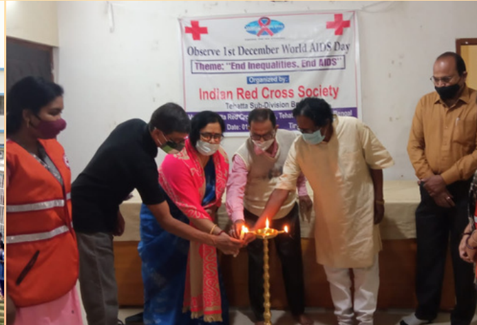
World AIDS Day observed by IRCS Tehatta Sub District Branch, West Bengal