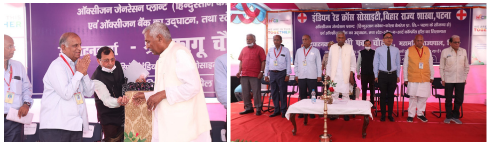
Hon'ble Governor of Bihar inaugurated Oxygen Generation Plant & Oxygen Bank at Patna