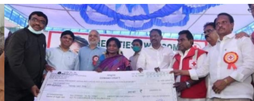
Dr. (Smt.) Tamilsai Soundararajan Hon'ble Governor & President IRCS, Telangana state branch laid foundation stone for the construction of thalassemia & sickle cell anaemia ward at IRCS blood bank building, Bhadrachalam district, Telangana