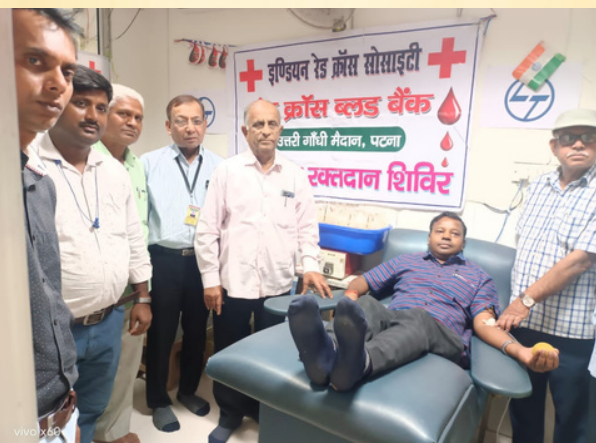
Blood donation camp was organised on World Health Day, Patna, Bihar