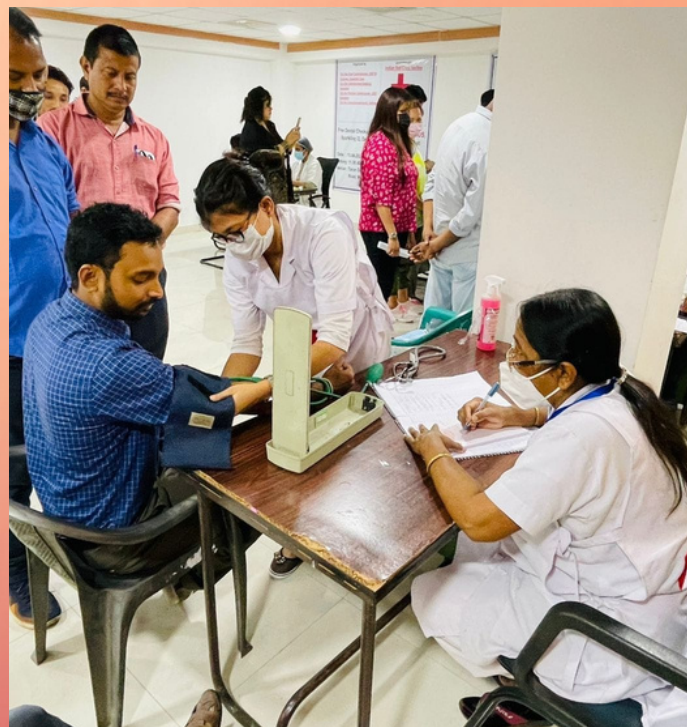
IRCS Guwahati district branch organized a medical camp at GST Bhawan Guwahati, Assam