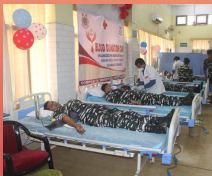
IRCS, Guwahati district branch organized a blood donation camp in collaboration with CRPF