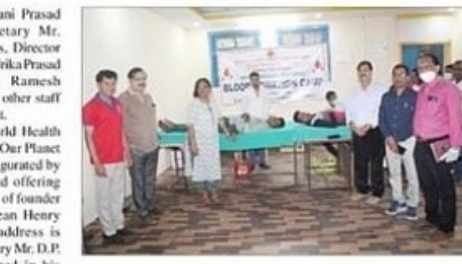
The Honorary Treasurer presided over the meeting and advised the counsellors and volunteers to work on climate