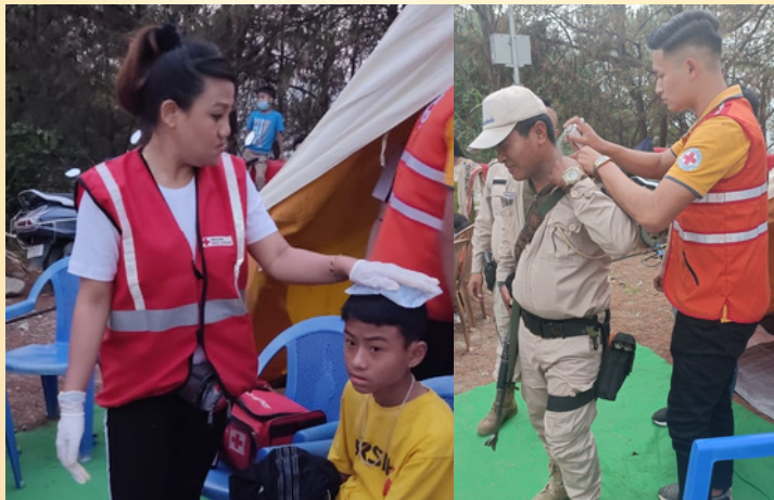
First Aid Post by IRCS, Imphal West District Branch, Cheiraoching