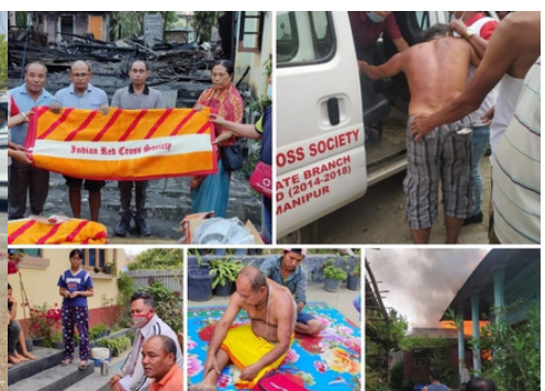
Relief assistance to fire victims, Imphal East district, Manipur