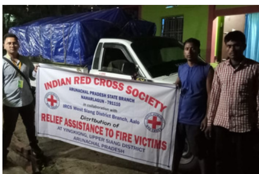
Distribution of relief assistance to fire victims, Yingkiang, Upper Siang district, Arunachal Pradesh.