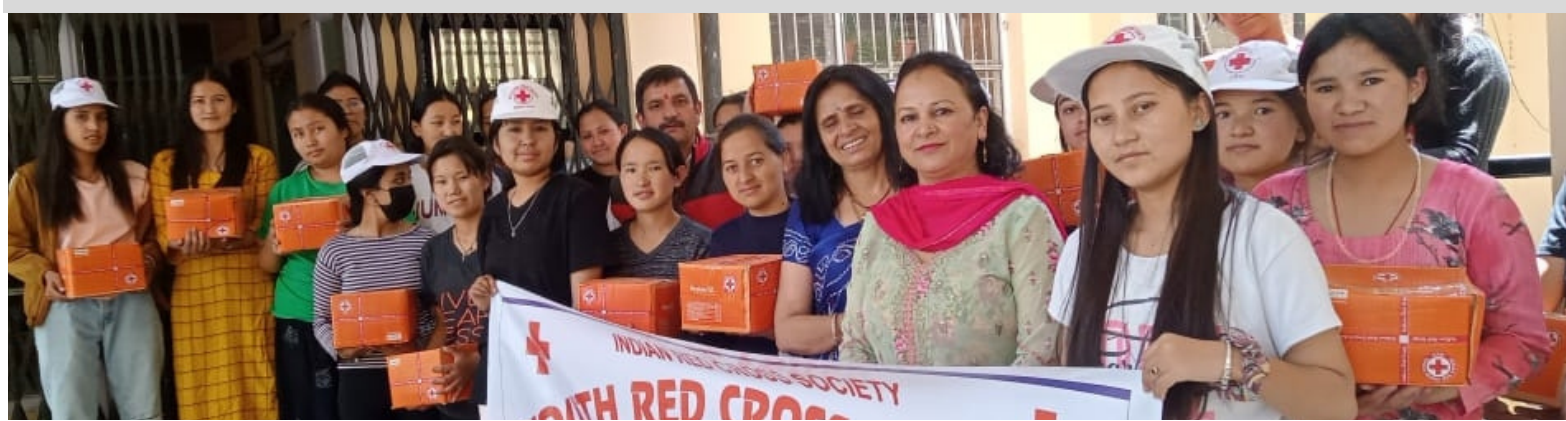
Distribution of hygiene kits amongst tribal students, Shimla, Himachal Pradesh