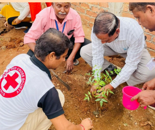
On World Health Day varied activities were undertaken at different districts (Kendrapara, Kandhamal & Sonepur) of Odisha like WASH programme, Cleanliness drive, First aid awareness sessions & blood donation camp.