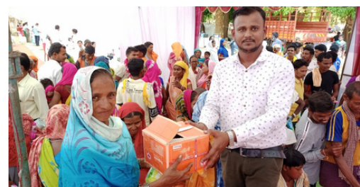
Distribution of hygiene kits, Dantewada, Chhattisgarh