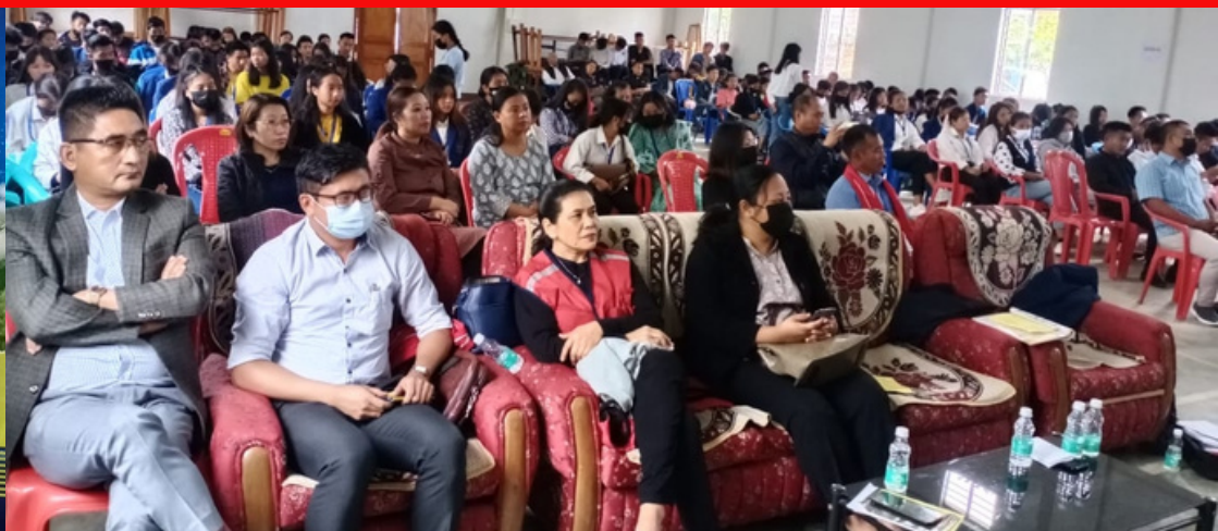
A mega seminar on blood donation and recruitment of junior Red Cross members was held at Longleng district branch, Nagaland