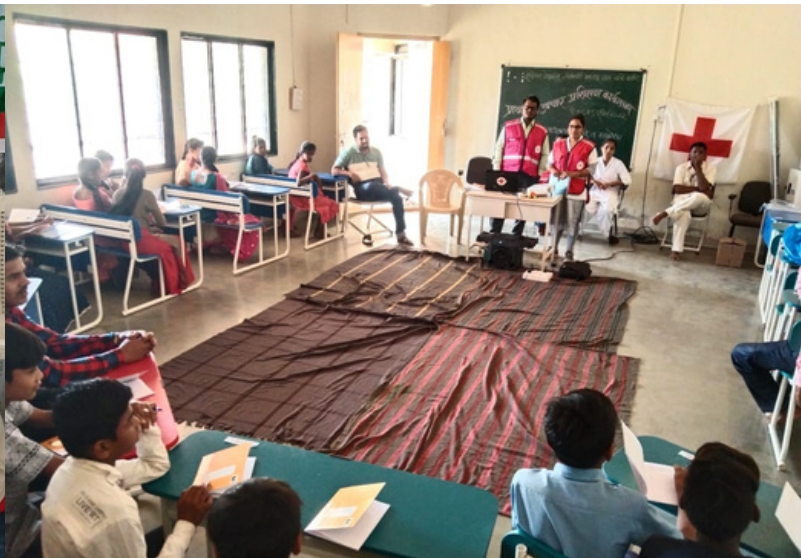
FA training in schools in Mahabeshwar taluka by Red Cross Bel Air hospital team under CSR initiatives of Beiersdorf India Pvt Ltd. (Hansaplast) MOU signed by Maharashtra state branch.