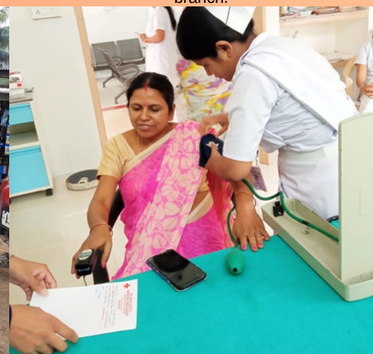
Free Health Camp at Red Cross Hospital Chandmari Guwahati, Assam on the Occasion of WORLD HEALTH DAY 2022