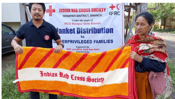
Distribution of blankets to underprivileged families by IRCS, Senapati District branch Manipur.