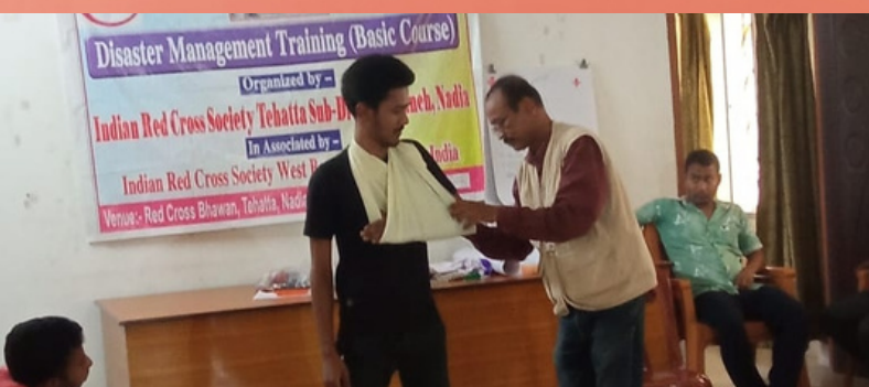
Disaster Management training, Nadia, Tehatta, West Bengal