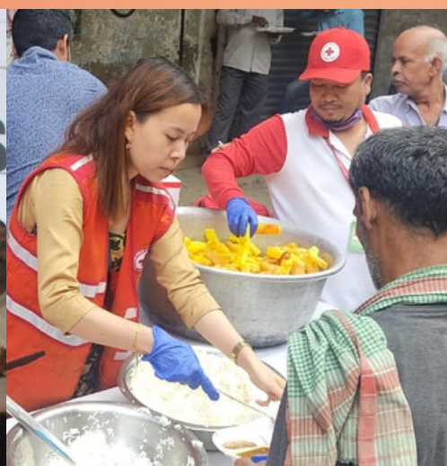
Volunteers of IRCS, Imphal West district branch served food on the occasion of Mahavir Jayanti.