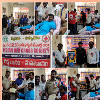
Blood donation, Wanaparthy, Telangana