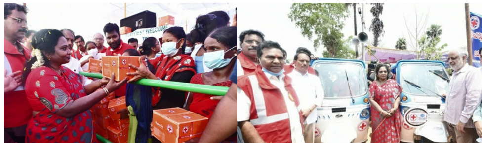
Dr. (Smt.) Tamilsai Soundararajan, Hon'ble Governor & President, IRCS, Telangana state branch handed over two electric auto ambulances to the tribal habitations of Pusukunta & Gogulapudi villages in the Bhadrachalam-Kothagudem district of Telangana to provide better medical & transport facilities for vulnerable people in remote tribal communities in times of emergency. She also distributed hygiene kits to the poor and vulnerable.