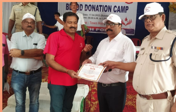
Blood donor being felicitated at blood donation camp, Boudh, Odisha