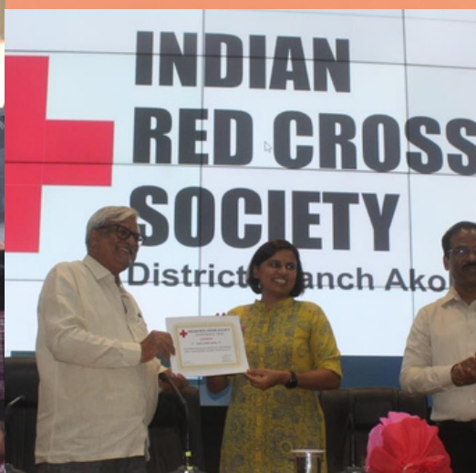
World Homeopathy Day was celebrated at Akola district branch, Maharashtra.