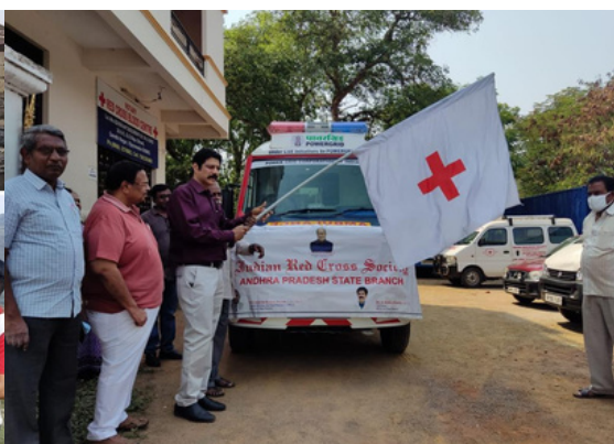
Power Grid Corporation of India limited donated an Advanced Life Support Ambulance to IRCS, Chittoor district branch.