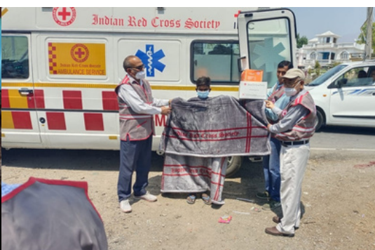
Relief assistance was provided to the fire victims at Bhauwala, Vikashnagar, Uttarakhand