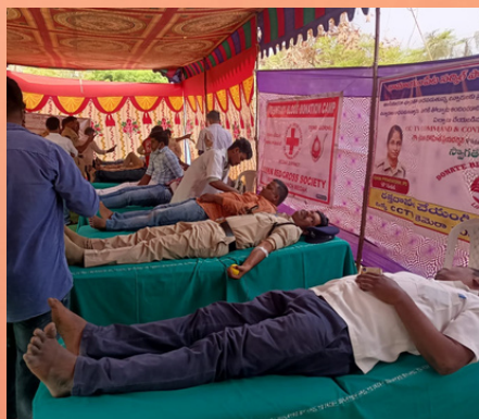
Blood donation, Medak, Telangana