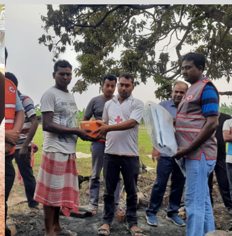
Distribution of hygiene kits & tarpaulins to the fire victims at Bagakhali Daspara village, Tehatta - I block