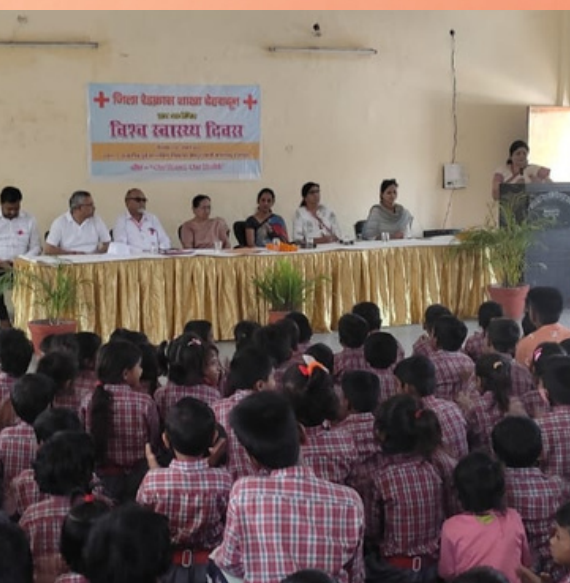
World Health Day, Dehradun, Uttarakhand