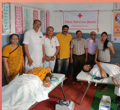
Blood donation camp, Aurangabad, Maharashtra