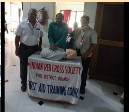
First aid training was organised on World Health Day, Pune, Maharashtra