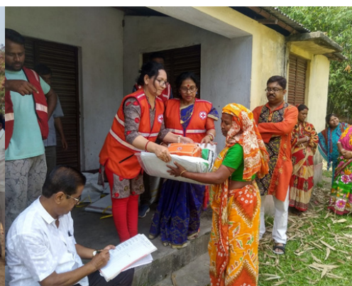
Distribution of hygiene kits, tarpaulins, mosquito nets and masks at Jalpaiguri, West Bengal

We are grateful to all our Donors and Volunteers for their generous support for IRCS relief efforts on behalf of millions of underprivileged and vulnerable families struggling to survive in the aftermath of the COVID-19 Pandemic. Thank you for your compassion, patience and contribution.