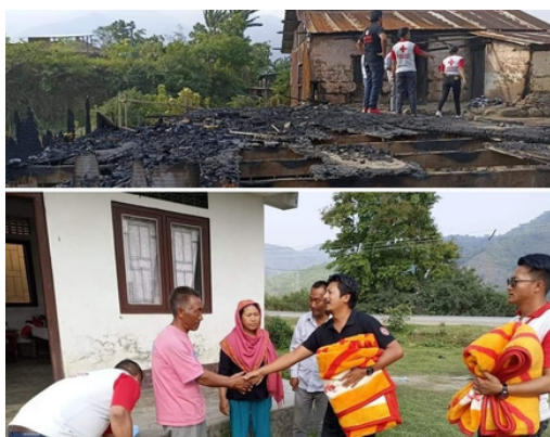
IRCS, Senapati district branch, Manipur youth volunteers visited the Mahika Tungjoy Baptist Church, Kalapahar & provided relief materials to the fire victims.