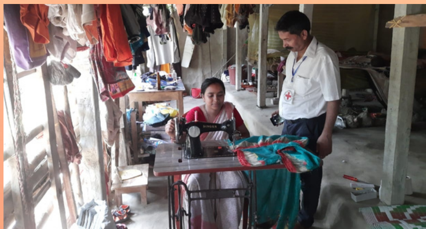
IRCS, North 24 Parganas district branch, West Bengal organised a health camp at Dhunucikhal village benefitting 244 patients. The officials also visited Sewing machine beneficiaries supported under Ray of Hope Project supported by French Ministry for Europe and Foreign Affairs.