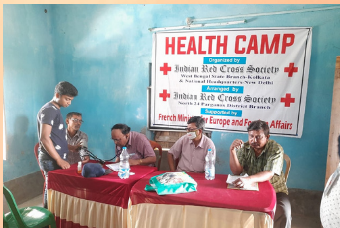
Health camp North -24 Parganas, West Bengal