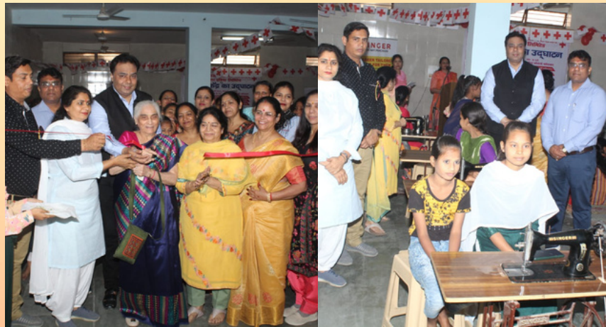
Stitching centre was inaugurated by IRCS, Faridabad, district branch in association with Vishambhara Sewa Trust.