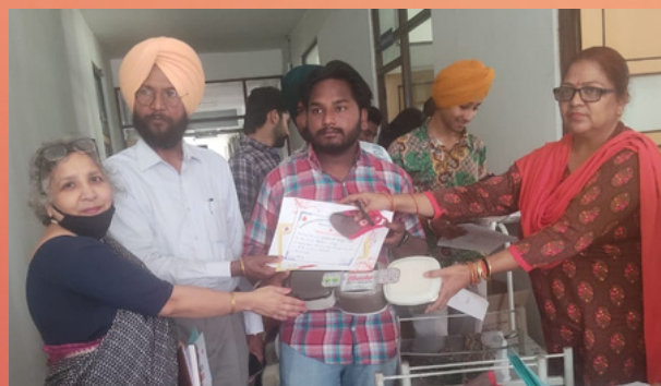
Blood donor being felicitated at blood donation camp, Mohali, Punjab