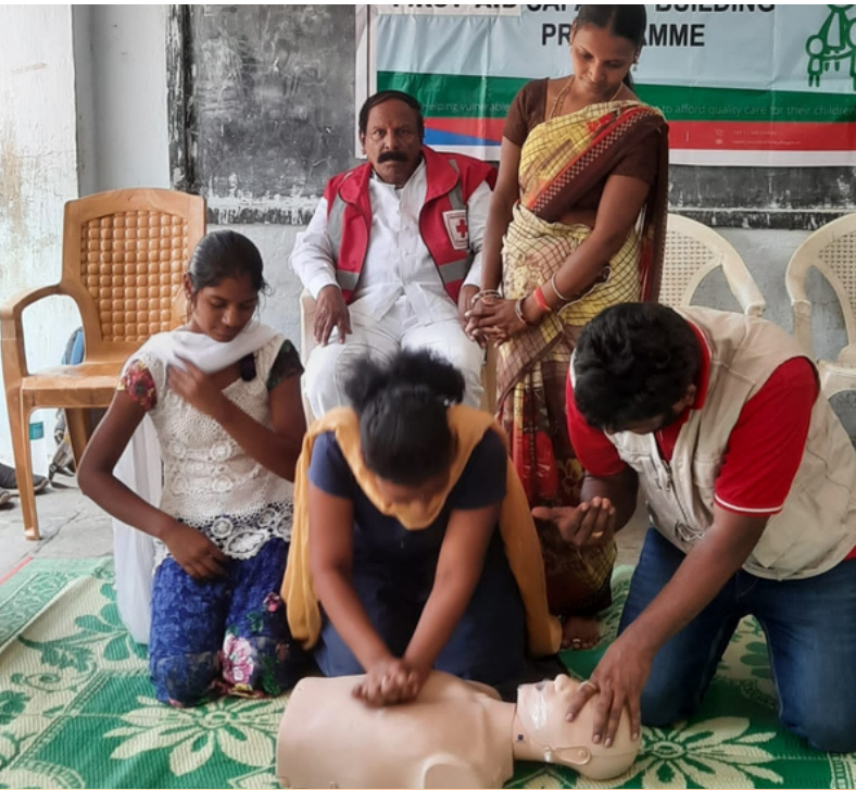
First aid training, Atmakur, Wanaparthy, Telangana