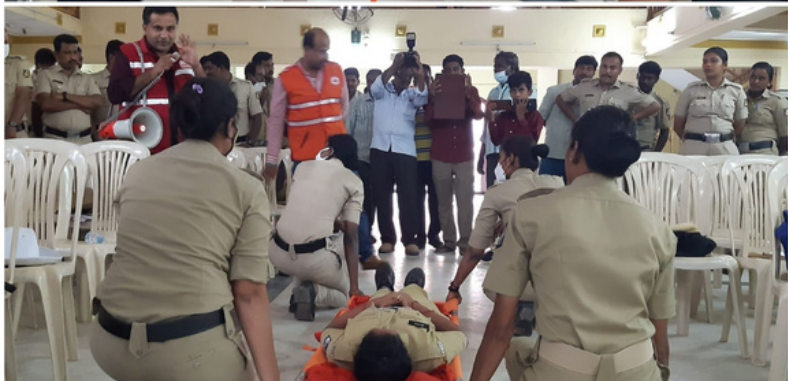
Training on lifesaving emergency response & first aid was held for police personnel at Ramanagra, district branch, Karnataka. More than 150 police personnel from various police stations of the district participated in the training.