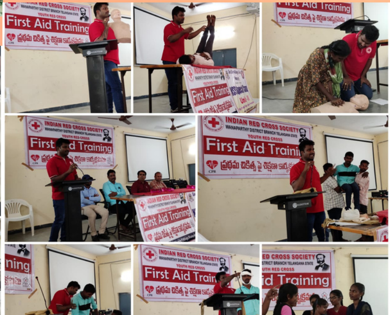
First aid training, Govt. Degree College, Wanaparthy, Telangana