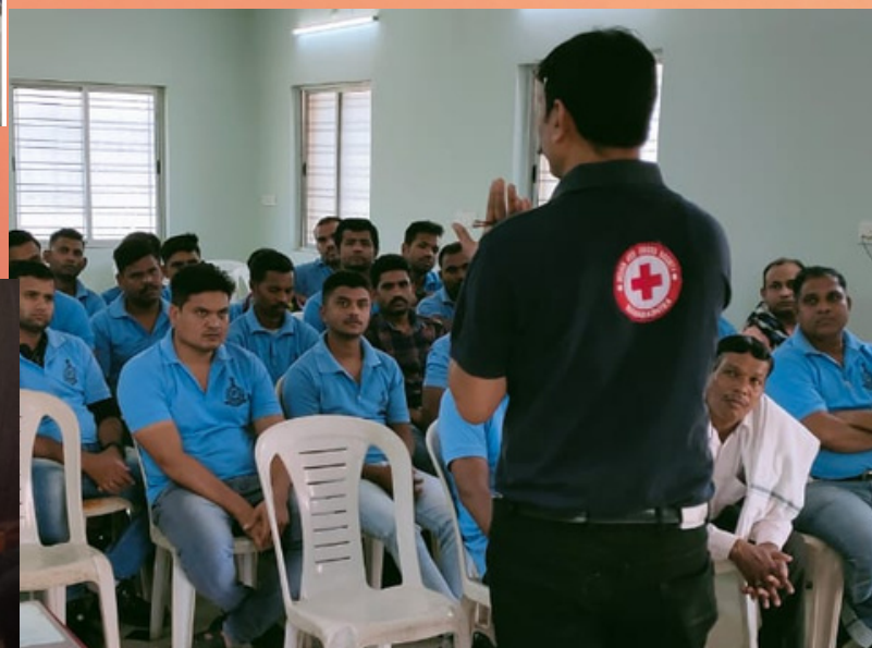
Gondia district branch, Maharashtra, celebrated fire safety week by FA training for Gondia fire brigade staffs.