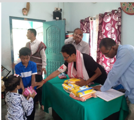
Office bearers IRCS of Darrang district branch visited children's home under Mangaldai Mahila Kalyan Samaj, Darrang & distributed gift items for their daily use.