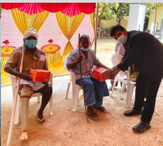
Distribution of hygiene kits amongst physically challenged people at Medchal Malkajgiri district, Telangana.